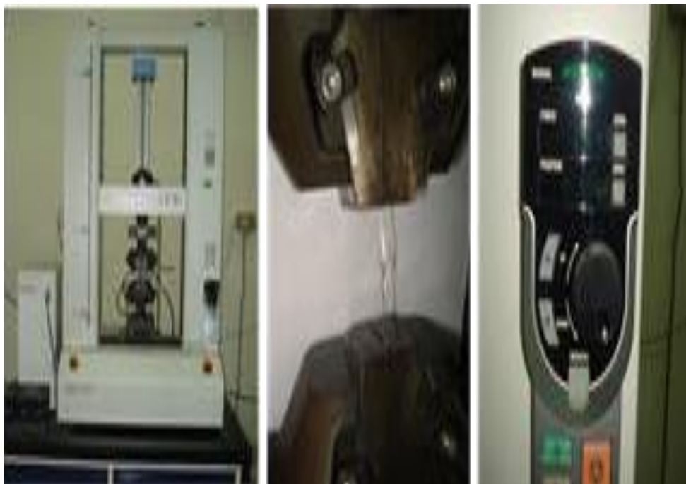
Fig 5: The modules engage the positioning jigs of the Instron universal testing machine and stretched to a predetermined length and the force levels being recorded.

An Instron universal testing machine (Instron model 1112, Instron Corp.) with a 5 kg load cell was used for this study. A piece of 23 gauge (0.55 mm diameter) stainless steel wire, bent in the form of hook was secured to the lower fixed clamp and a second identical piece of wire parallel to the first wire was attached to the load cell of the testing machine. The modules were placed between the hooks and stretched at the rate of 0.2" (5 mm) per minute as described by Kovatch to a predetermined length of 4.1mm (Fig 5). [20]