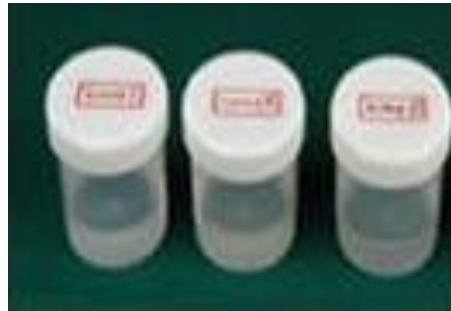
Fig 4: Sterile containers used for transporting the samples to the lab

Thirty samples belonging to each group from the 10 patients were retrieved after the specific time interval and replace with fresh modules. The samples were rinsed with distilled water to remove the loosely bound deposits. They were grouped and stored in labelled sterile containers with distilled water and transported to the laboratory and subjected to testing within a time span of 3 hours (Fig 4).