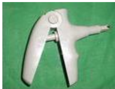
Fig 2: Power shooter module changer

Each elastomeric modules were placed in the patient's mouth on the specified lower incisor brackets (Group I – Lower right lateral incisor, Group II – Lower right central incisor & Group III – Lower left central incisor) in a conventional figure of ‘O’ pattern using a power shooter module changer (Straight shooter ligature gun, TP orthodontics) with utmost care (Fig 2&3). The modules belonging to each group were evaluated at 4 different timeintervals at 0 hour (as received), 24, 7 days, and 21 days after intra-oral use.