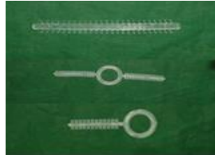
Fig 1: Clear elastomeric ligature modules belonging to Group I, Group II & Group III

The clear elastomeric ligature modules supplied by three different manufacturers formed the three study groups [Group I: Molded “O” (Ormco, USA), Group II: Alastik (3M Unitek, USA) and Group III: Uni-stick (American Orthodontics, USA)] (Fig 1).